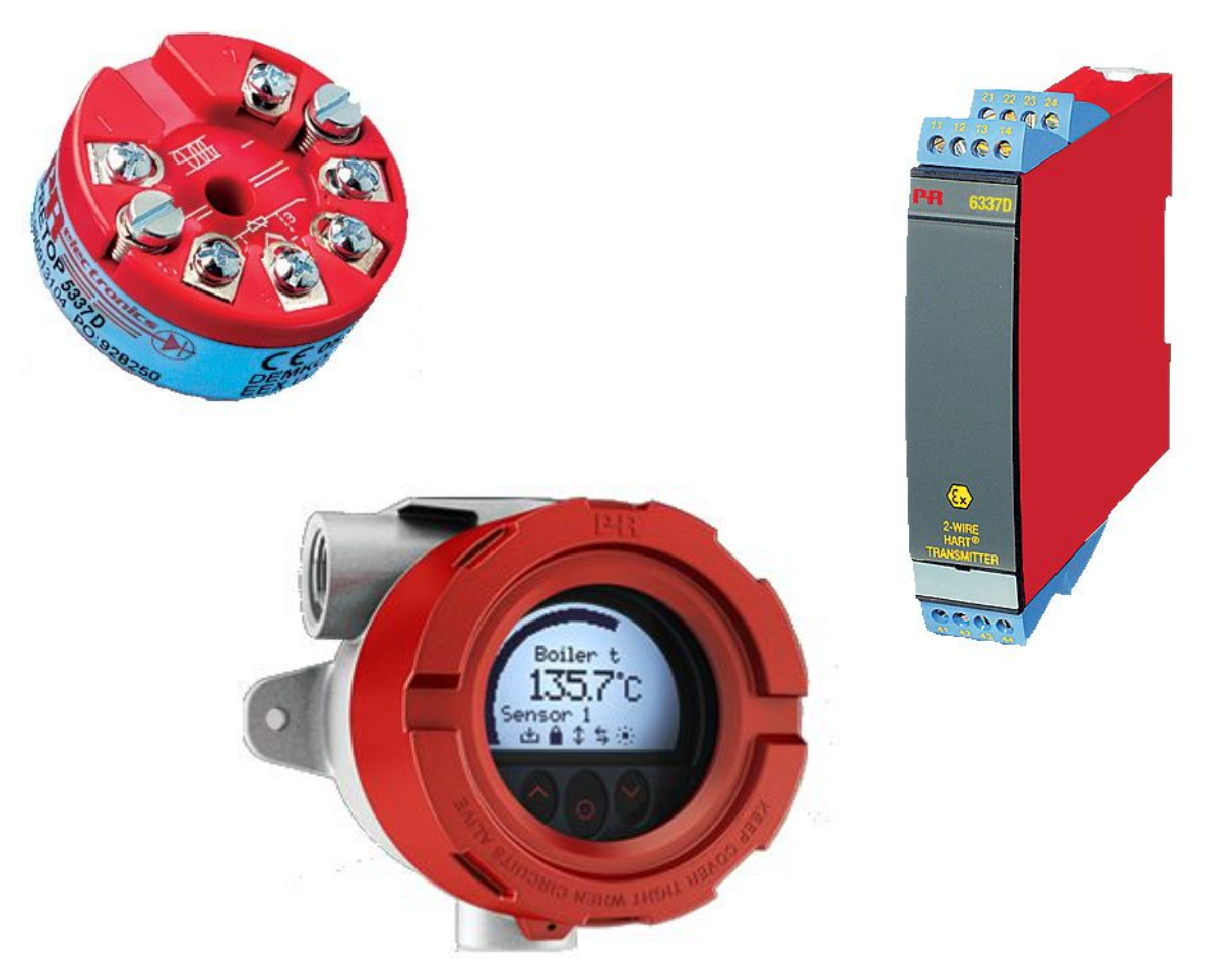
Figure 1: Temperature transmitter PR5337 / PR6337 / PR7501

The temperature transmitter PR5337 / PR6337 / PR7501 with 4..20 mA output can be considered to be a Type B element with a hardware fault tolerance of 0. Figure 1 shows the three temperature transmitters PR5337 / PR6337 / PR7501.